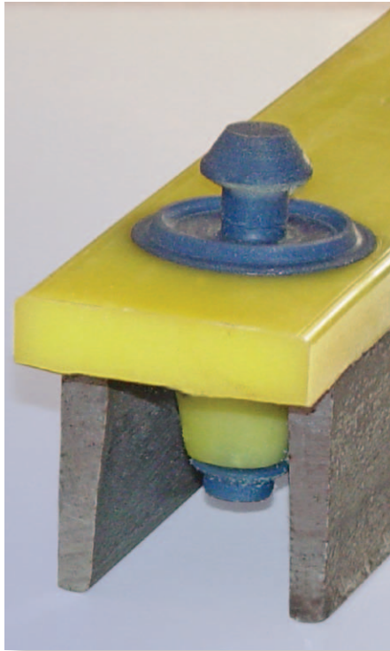
Channel Adapter Strip